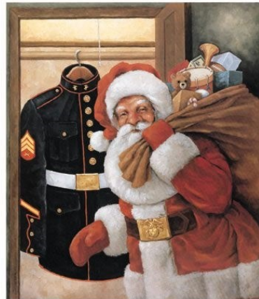
U.S. MARINE CORPS RESERVE

We are collecting new and unwrapped toys for the local "Toys for Tots" location in Madison. We will be taking donations until December 10, 2021 at 12 noon. Please feel free to stop by the housing office with any toys that you would like to donate. Thank you to everyone who has donated, we truly do appreciate it!