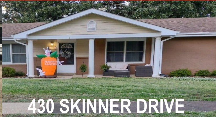
430 SKINNER DRIVE