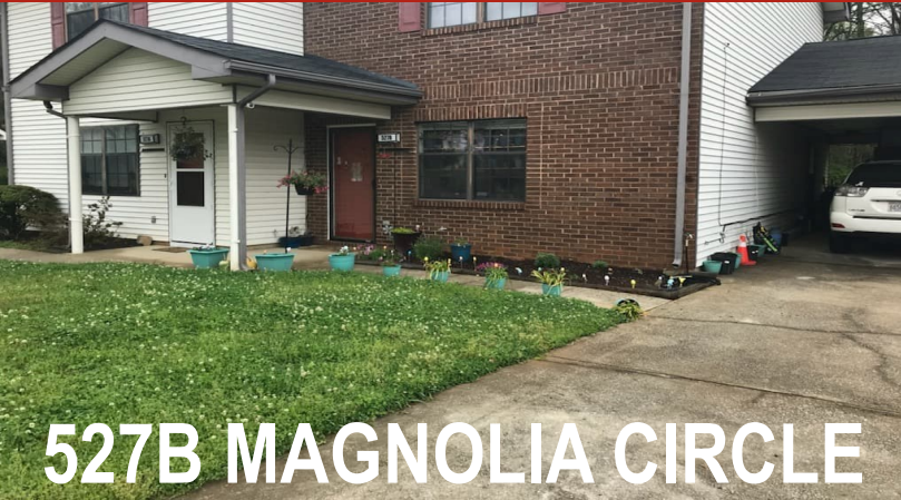
527B MAGNOLIA CIRCLE