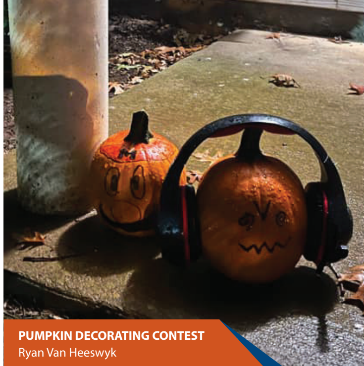
PUMPKIN DECORATING CONTEST Ryan Van Heeswyk