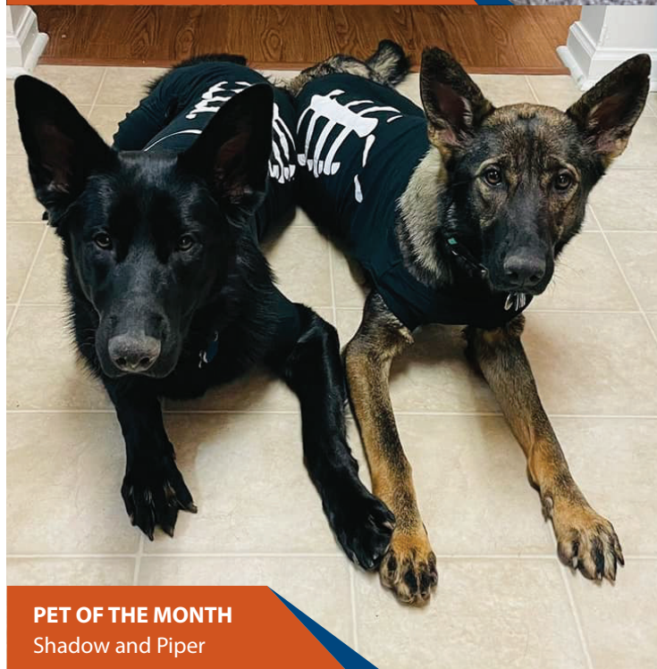
PET OF THE MONTH Shadow and Piper