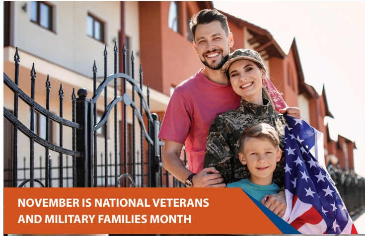
NOVEMBER IS NATIONAL VETERANS AND MILITARY FAMILIES MONTH

To enter, head over to our Facebook page, Redstone Family Housing, and comment under the Small Business Saturday contest post (need to determine rules from AG social) by 11:59 PM EST, November 27th. One winner will be announced on November 28th and win a free basket filled with goodies from small businesses around Huntsville.